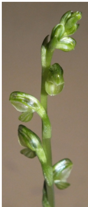
Pterostylis mutica