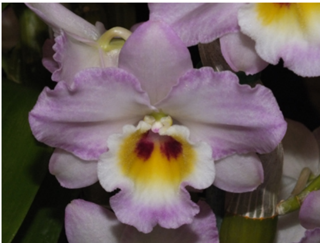
Den Pink Doll 'Elegance' P Duong