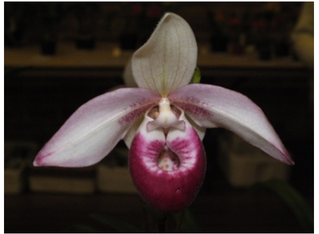
Phrag sedenii G&A Cushway