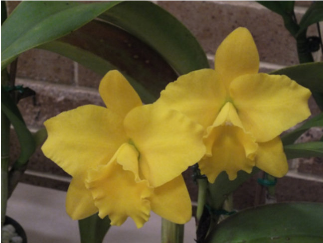
Pot Free Spirit 'Laina' G&L Bromley