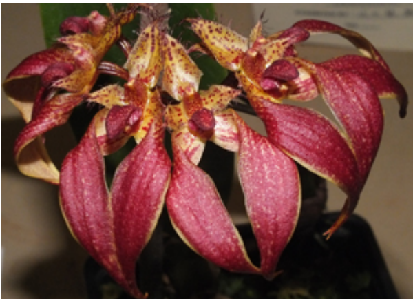
Bulb Ador-a-bil 'Anna Roth'