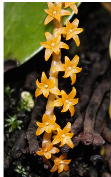
Chaaengis harriotiana