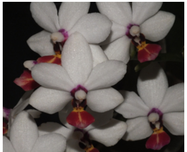
Dtps. Sogo Chabstic 'Hsinying'